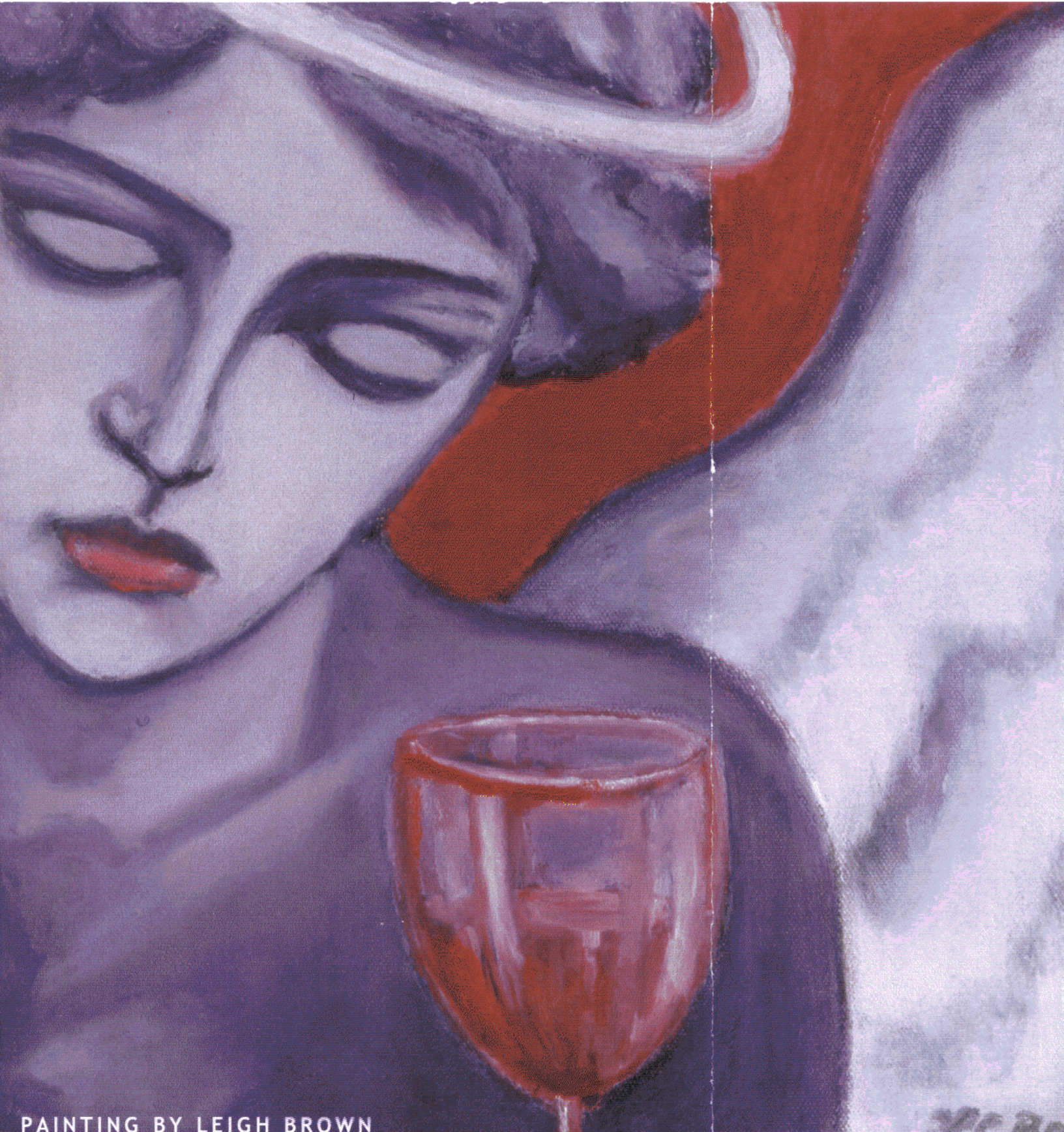
PAINTING BY LEIGH BROWN