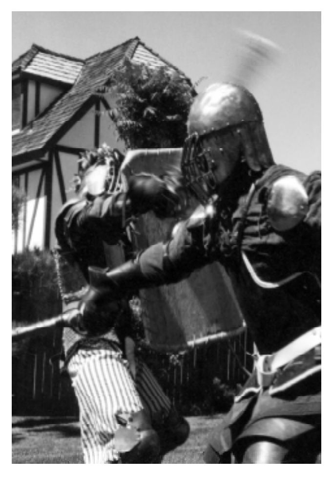
Medieval Knights do mightly battle for damsels in distress - well at least for the honor of doing fine battle.

Or just enjoy our plain fireweed honey mead. $10.00 ea.